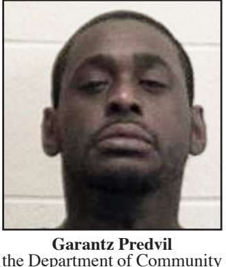
the Department of Community Supervision, according to the Sheriff's Office. Once there, deputies

discovered a gun on the scene See Arrested, Page 3A