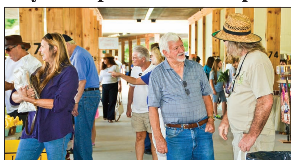
It may be some time yet before the Farmers Market returns to the bustling social environment of yesteryears, as depicted in this photo taken on a warm market day in 2016.