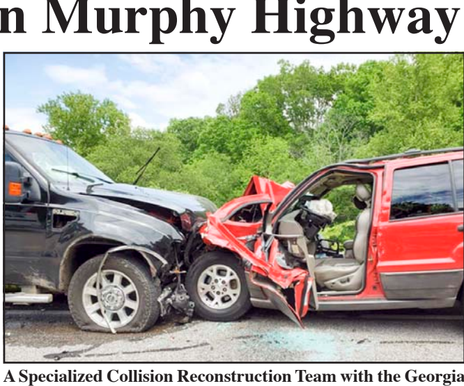
State Patrol investigated this fatal accident on Murphy Highway

Two suspects arrested on gun charges over Memorial Day Weekend